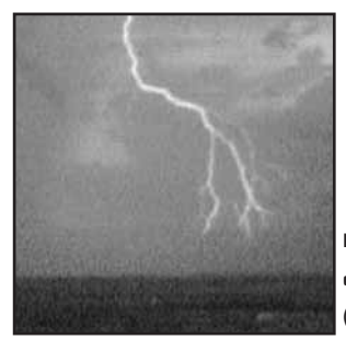
Branched downward stepped leaders