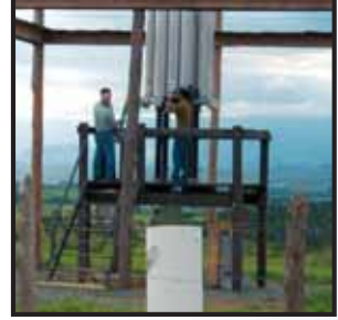
Rocket launch tuhes