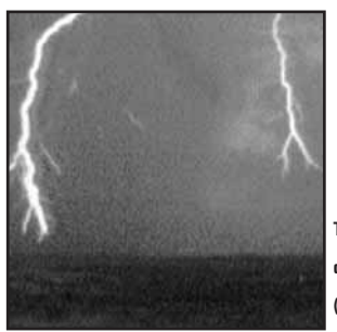
Two concurrent downward stepped leaders