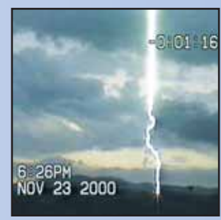
LRS-A triggered launch rocket